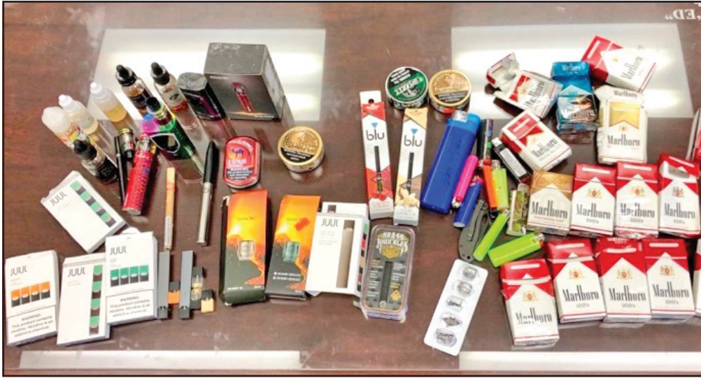
All this - tobacco and nicotine/vaping products - was confiscated from about six vehicles, mostly just sitting in plain sight, in a recent walkthrough of the Union County High School parking lot.

behind on. "The kids knew everything about all this stuff. but the adults didn't. Now, it's going the other way."